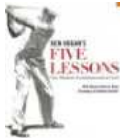
Ben Hogan's Five Lessons: The Modern Fundamentals of Golf by Ben Hogan