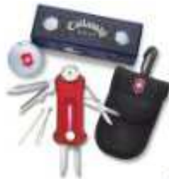
Victorinox Swiss Army Golf Tool With Callaway Golf Balls by Victorinox