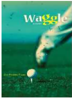
Waggle by Joe Redden Tigan