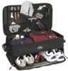
Samsonite Golf Trunk Organizer by Samsonite