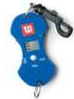
Wilson Golf Bag Tag/Score Keeper by Wilson